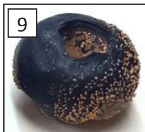
FIGURE 9. ANTHRACNOSE RIPE ROT IS RECOGNIZED BY MASSES OF SALMON-COLORED STICKY SPORES.

Anthracnose is a fungal disease caused by the fungus Colletotrichum fioriniae ( C. acutatum species complex), but it can also be caused by other Colletotrichum species. These fungi overwinter in diseased branches, old fruit spurs, and bud scales, as well as on infected fruit left on the plant or on the ground. Spores (conidia) are released during rainy periods throughout the growing season and are spread via rain splash and overhead irrigation. The sticky spores can also be spread by workers and equipment. Infections may occur anytime, beginning during bloom. Temperatures between 60°F and 80°F, along with leaf wetness exceeding 12 hours, favors infection.