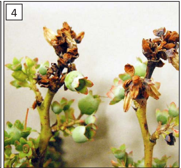
FIGURE 2. PHOMOPSIS CANKER CAUSES GIRDLING OF TWIGS AND BRANCHES; DARK PYCNIDIA ARE OFTEN VISIBLE IN LESION CENTERS. FIGURE 3. THE PHOMOPSIS PATHOGEN CAN INFECT NEW BRANCHES AND OLDER WOOD CAUSING RAPID DIEBACK. FIGURE 4. PHOMOPSIS FLOWER AND BUD BLIGHT RESULTS IN RAPID DIEBACK AND LOSS OF FLOWERS AND FRUIT.