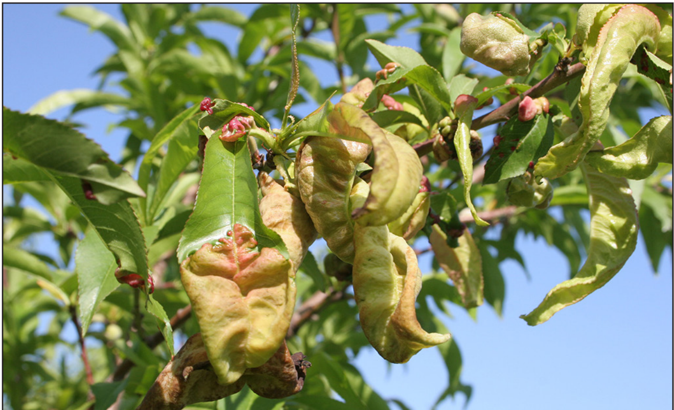
FIGURE 1. PEACH LEAF CURL CAUSES THICKENED, CURLED LEAVES ON PEACH, APRICOT, AND NECTARINE.

Peach leaf curl occurs annually in commercial and residential orchards throughout Kentucky. The disease causes severe defoliation, weakens trees, and reduces fruit quality, fruit set, and yield. Peaches, apricots, and nectarines are susceptible to peach leaf curl. Plum pockets is a similar, but less common, disease that occurs on wild and cultivated plums.