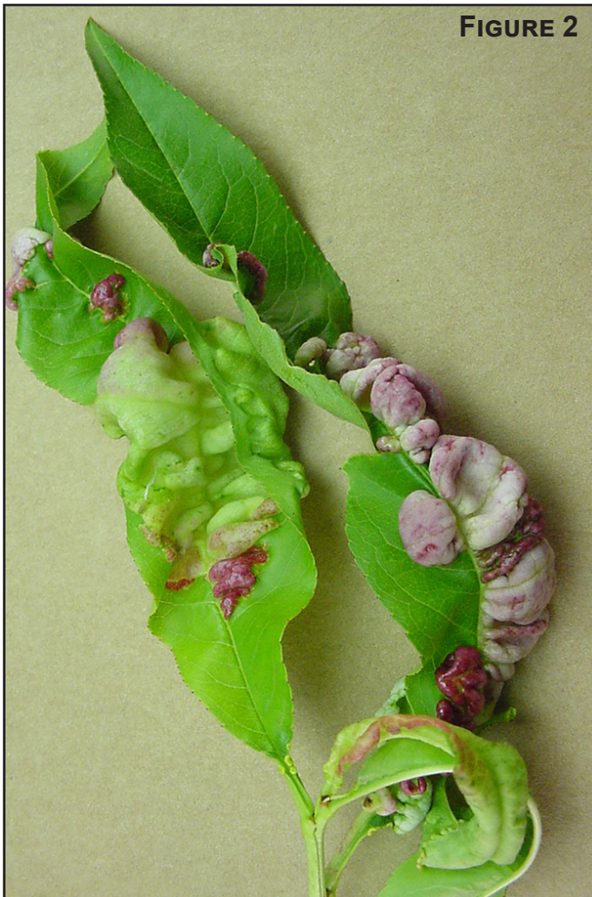
FIGURE 2. RED AND PURPLE COLORATION IS COMMON ON THICKENED, CURLED LEAVES.

Peach leaf curl is easily recognized by the presence of thickened, puckered, and curled leaf blades (FIGURE 1). Symptoms are even more conspicuous when accompanied by a red or purplish discoloration (FIGURE 2). Diseased areas develop a powdery gray coating of sexual fruiting structures (called asci ) and reproductive spores (called ascospores ). Leaves may eventually turn brown, wither, and drop from trees. Twig and fruit infections, which are less obvious than foliar symptoms, can also occur. Yearly defoliation can seriously weaken trees and cause them to become more sensitive to cold injury and other stresses.