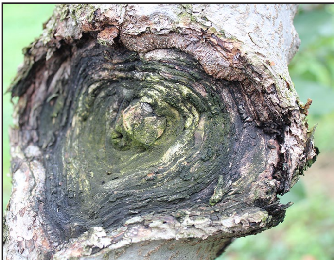
FIGURE 4. BLACK ROT CANKER; THE BLACK ROT FUNGUS CAN INFECT OLD PRUNING WOUNDS AND FIRE BLIGHT CANKERS.

Branch cankers initially appear as slightly sunken reddish-brown areas on bark. Old fire blight strikes, pruning wounds, and winter-injured tissue are frequently sites for black rot infections (FIGURE 4). Cankers may expand to several feet in length and girdle limbs, weakening and eventually killing branches.