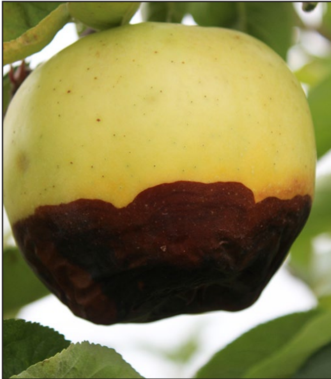
FIGURE 2. FRUIT INFECTIONS RESULT IN DECAY THAT OFTEN BEGINS AT THE BLOSSOM END.