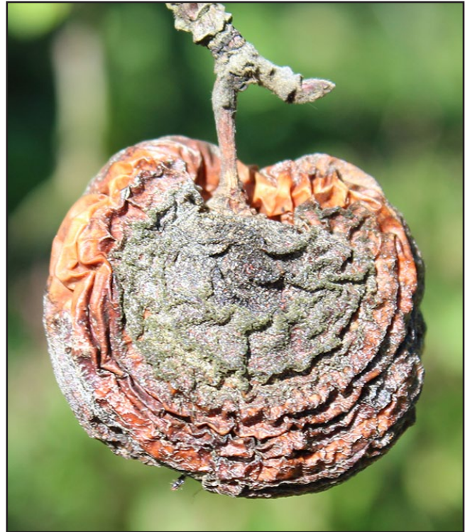
FIGURE 3. THE PATHOGEN OVERWINTERS IN DISEASED FRUIT THAT HAS SHRIVELED AND DEVELOPED INTO MUMMIES.