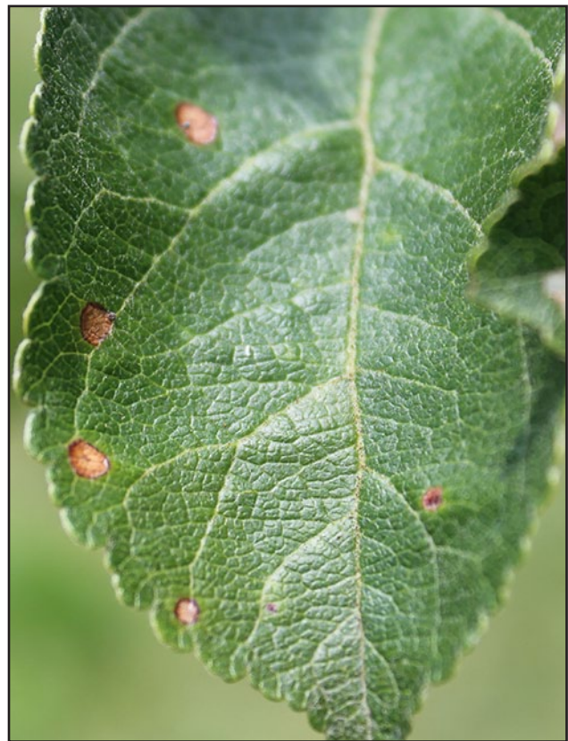
FIGURE 1. FROGEYE LEAF SPOT RESULTS IN CIRCULAR LESIONS THAT HAVE TAN CENTERS AND DARKER MARGINS.

Fruit infections, which may follow frogeye leaf spot, usually begin in the blossom (calyx) end of developing fruit (FIGURE 2). As decay expands,