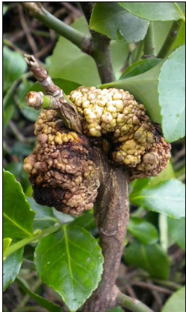
FIGURE 1. CROWN GALL TUMORS, SUCH AS THIS ONE ON EUONYMUS, ARE INITIALLY WHITE AND FLESHY IN APPEARANCE.

On many hosts, tumors begin as spherical structures (FIGURE 2). Secondary galls can be more irregular in shape. In the case of grape, a series of very small galls may form underneath bark tissue (FIGURE 5). Galls may not initially be evident (FIGURE 6) until bark splits and peels as a result of gall enlargement and expansion.