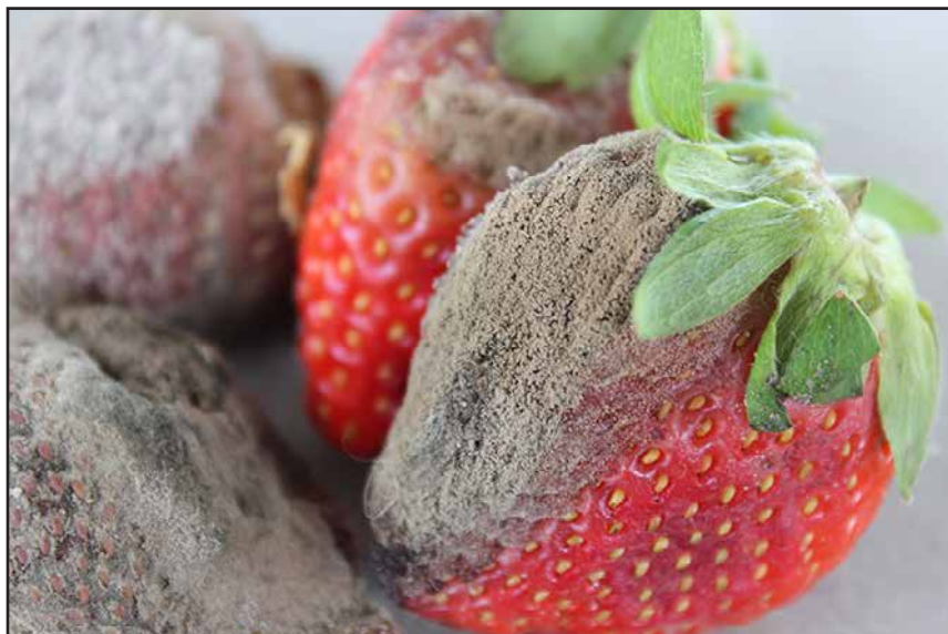
FIGURE 1. THE GRAY TO TAN MOLDY GROWTH CHARACTERISTIC OF BOTRYTIS BLIGHT COVERING INFECTED STRAWBERRY FRUIT.

Botrytis blight may affect seedlings, buds, flowers, fruit, leaves, stems, and bulbs. Symptoms can vary depending on the host and plant tissue infected, but the presence of a distinctive gray to light-brown, fuzzy, moldy growth on diseased tissue is common to all (FIGURE 1). This moldy growth is comprised of fungal strands (mycelia) and clusters of spores (conidia).