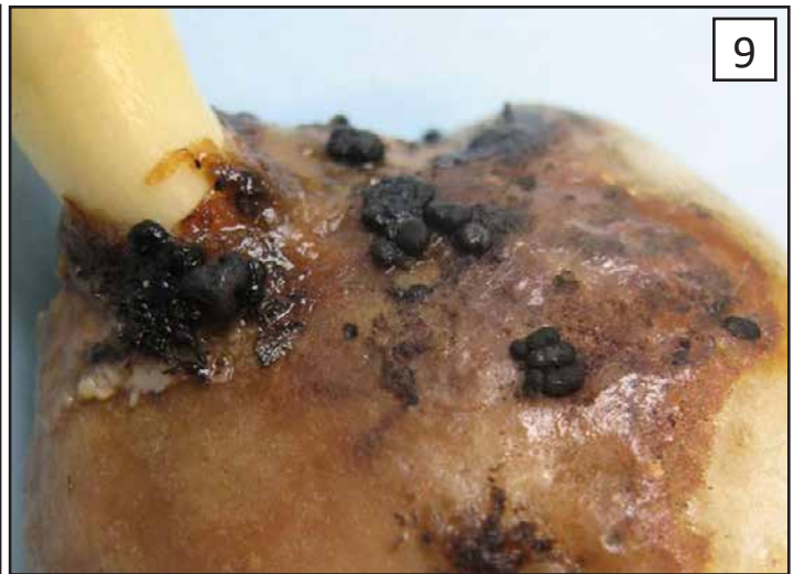
FIGURE 8. PEONY STEM ROT DUE TO BOTRYTIS INFECTIONS. FIGURE 9. BOTRYTIS RESTING STRUCTURES (SCLEROTIA) PRESENT AT THE NECK OF DECAYING ONION BULB.