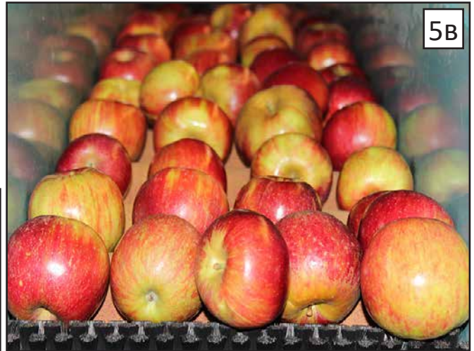
FIGURE 5. STORAGE FACILITIES SHOULD ALWAYS BE KEPT CLEAN WITH (A) PRODUCE KEPT OFF THE FLOOR, AND (B) SORTED AND STORED APPROPRIATELY.