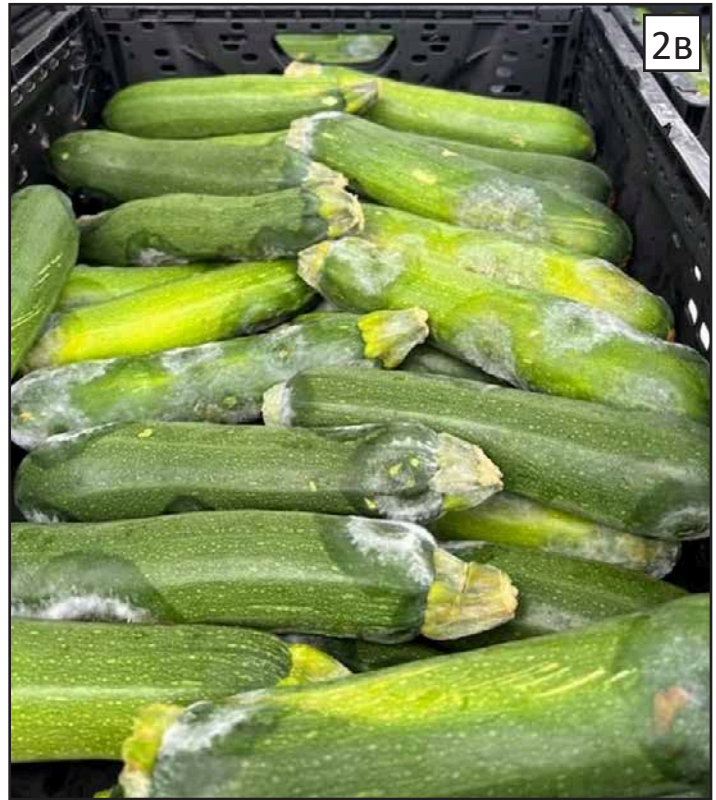
FIGURE 2. Fruit wounds such as (A) ABRASIONS OR SUNSCALD CAN ALLOW ENTRY BY DISEASE-CAUSING PATHOGENS, WHICH CAN LATER LEAD TO (B) DISEASE ONSET IN STORAGE. DAMAGE DURING HARVEST MAY INCREASE THE RISK OF DISEASE DEVELOPMENT IN STORAGE.