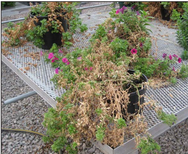
FIGURE 1. GREENHOUSE SANITATION INVOLVES THE ELIMINATION OF INFECTED PLANT TISSUE AND DEBRIS SO THAT PATHOGENS ARE NOT SPREAD TO HEALTHY PLANTS.

Reduction of pathogens by various sanitation practices can reduce both active and dormant pathogens. While actively growing plants can provide host tissue for pathogen multiplication, plant debris and dead plant material (FIGURE 3) can harbor overwintering propagules (fungal spores, bacterial cells, and virus particles) for months or years. These propagules can travel through wind/fan currents, stick to shoes or tools, or move with contaminated soil or water droplets. Thus, prevention of spread of pathogens to healthy plants and elimination of any disease-causing organisms from one cropping cycle to another is the basis for a disease management program using sanitation practices.