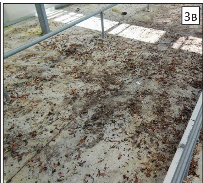
FIGURE 3. CLEAN UP SOIL AND PLANT DEBRIS FROM FLOORS, INCLUDING (A) WALKWAYS AND (B) UNDER BENCHES, IN ORDER TO ELIMINATE SOURCES OF DISEASE PATHOGENS.