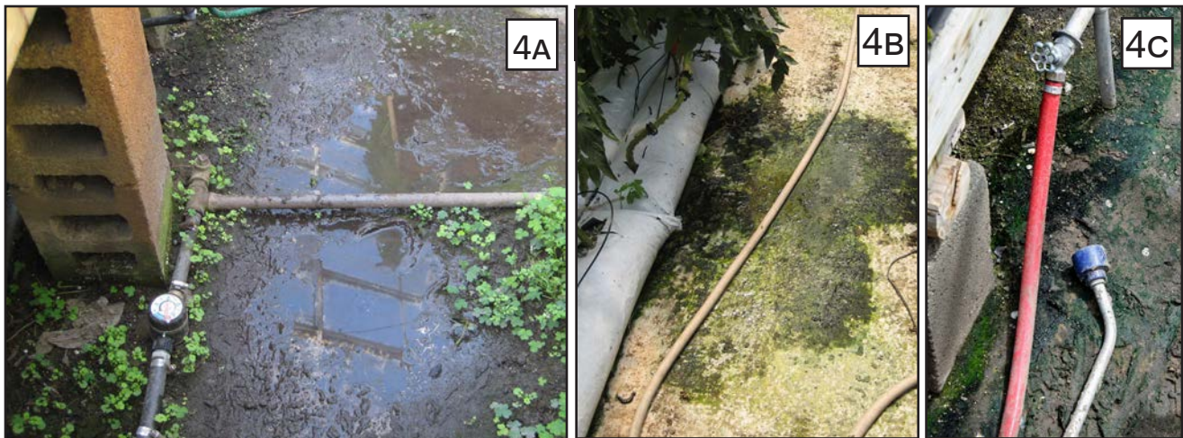
FIGURE 4. (A) WEEDS, SOIL, AND RUNOFF CAN ALL SERVE AS SOURCES FOR PATHOGEN SPREAD AND/OR OVERWINTERING. GREENHOUSE FLOORS SHOULD REMAIN CLEAN AND DRY; BARE SOIL SHOULD BE COVERED WITH GRAVEL OR CONCRETE. (B) HOSES AND (C) SPRAYER NOZZLES SHOULD NOT BE DRAGGED ALONG THE GROUND WHERE THEY CAN PICK UP PATHOGENS.