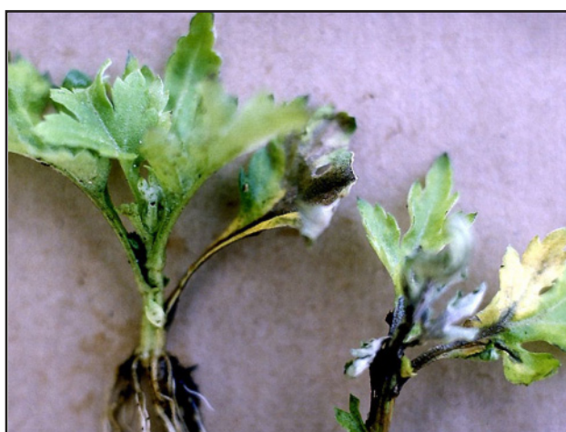
FIGURE 1. BROWN TO BLACK STEM DECAY IS A COMMON SYMPTOM OF BACTERIAL BLIGHT; OFTEN PLANT DEATH RESULTS.