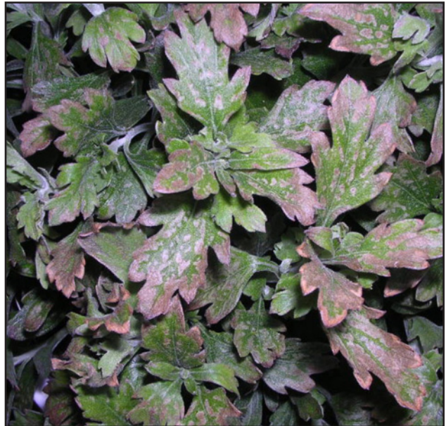
FIGURE 11. HIGH SOLUBLE SALTS ACCUMULATE AT LEAF MARGINS AND LEAF TIPS, CAUSING THEM TO TURN BROWN.

Interveneal chlorosis of young leaves is the first indication of iron deficiency. When severe, entire leaves may turn yellow or nearly white and irregularly shaped necrotic (dead) areas appear between veins. Plant growth is slowed and flowering is delayed.