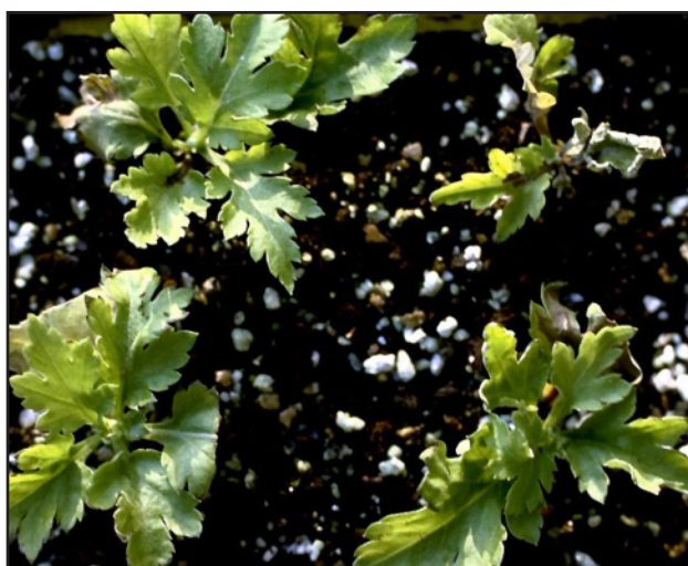
FIGURE 2. SEEDLINGS INFECTED WITH THE BACTERIAL BLIGHT PATHOGEN OFTEN BECOME STUNTED.