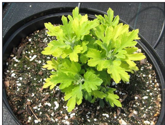
FIGURE 12. CALCIUM DEFICIENCY RESULTS IN NEW GROWTH THAT IS UNDERSIZED, THICKENED, AND CHLOROTIC.

Affected plants are pale green with marginal and interveinal chlorosis of the new growth. Foliage eventually becomes uniformly chlorotic and necrotic spots may develop along leaf margins. Newly formed leaves are smaller than normal and flowering is delayed. As the deficiency continues, lower leaves gradually become necrotic, cup downward, and wilt. Root systems are undersized, but otherwise appear healthy.