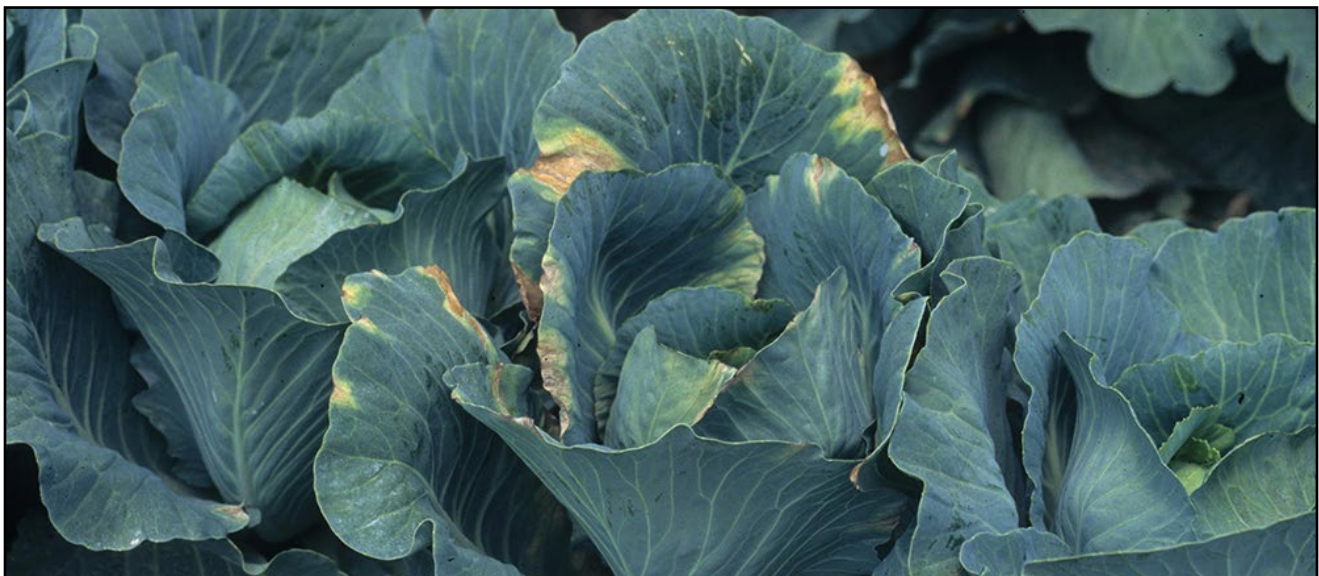
FIGURE 1. V-SHAPED LESIONS DEVELOPING ALONG LEAF MARGINS ARE CHARACTERISTIC SYMPTOMS OF BLACK ROT.

Initial symptoms appear as distinct, yellow V-shaped lesions along leaf margins, with the bottom of each "V" pointing inward (FIGURE 2). Lesions turn brown as they become necrotic (dead) (FIGURE 3), enlarging until entire leaves yellow, wilt, and fall from plants. Leaf veins in affected areas turn from green to dark-brown to black.