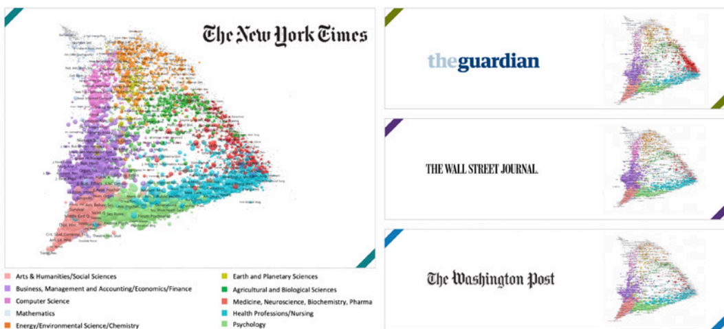
Figure 2 Comparative Scatter Graph of Journals Citing Newspapers, 2000-2017

The comparative scatter graphs in Figure 2 demonstrate hot spots where newspapers are most cited within academic disciplines.