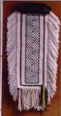
Design Represents Phases of the Moon

The smaller pieces are designs from the robe’s borders; the largest, from its center. Each piece represents a traditional story. The weavings are merino wool with sea otter trim.