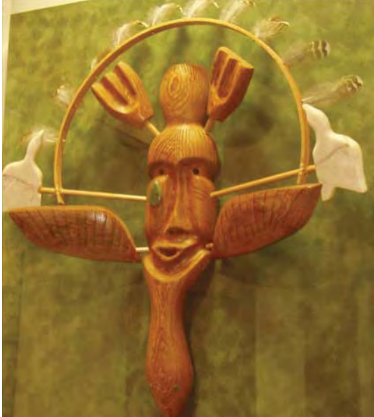
Crafted by Richard Quidvy of Mountain Village, cottonwood, alabaster, and soapstone are melded to create this exceptional loon mask.