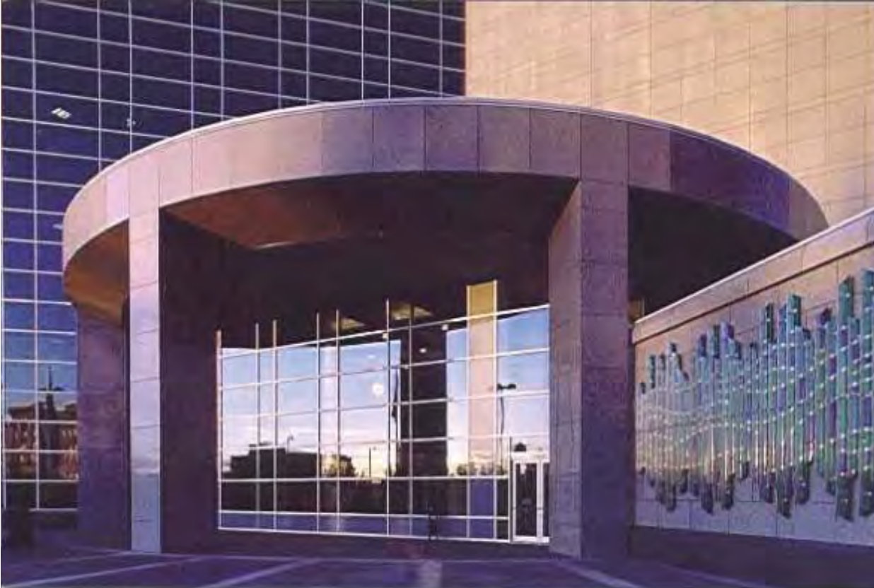
Rabinowitz Courthouse Main Entry