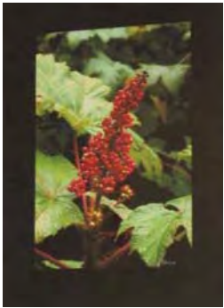
Devil's Club

The library space is enlivened with eight vividly colored photographs of Alaska wildflowers, plants, and trees. These are a representative sample: