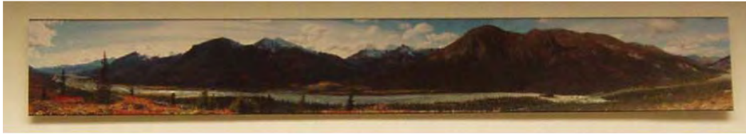
Dietrich River Valley

Shown here is one piece of a triptych which spans across the east wall, above the customer service counter.