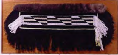
Design: Bear Tracks