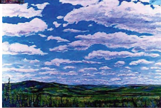
"Summer Interior Valley"

"Summer Interior Valley" is a vista of a valley in summer.