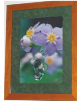
Forget-Me-Not