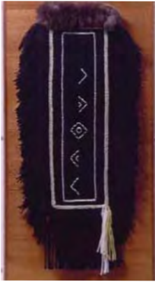
Design is the Most Common In Traditional Robes