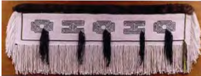
Design: “Raven’s Tail” and “War Club”