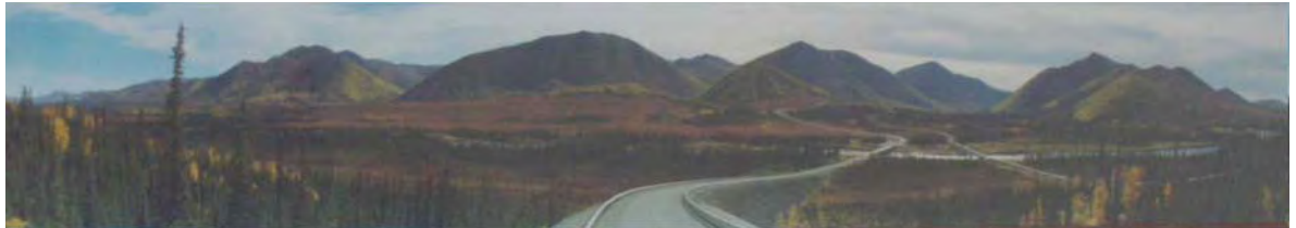
Dalton Highway at Koyukuk Crossing