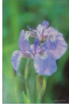
Wild Iris