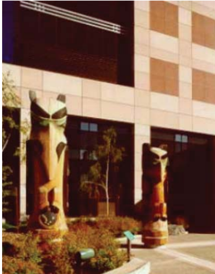
PUB-35 (Ivory) June 2006