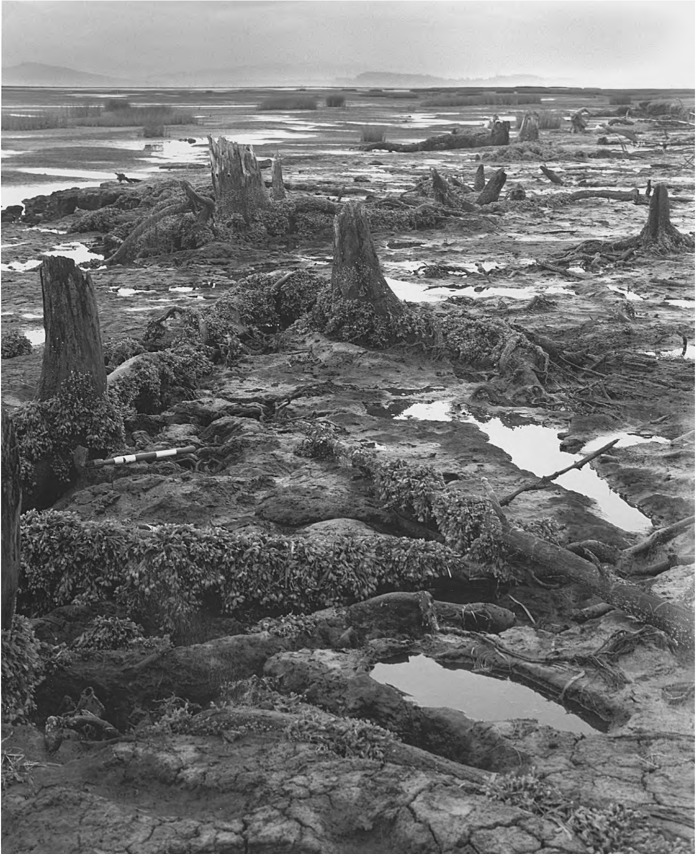
Spruce cannot live where barnacles and rockweed cling. Trees like these, killed by tidal submergence, fueled discoveries in the late 1980s and early 1990s about earthquake hazards at Cascadia.