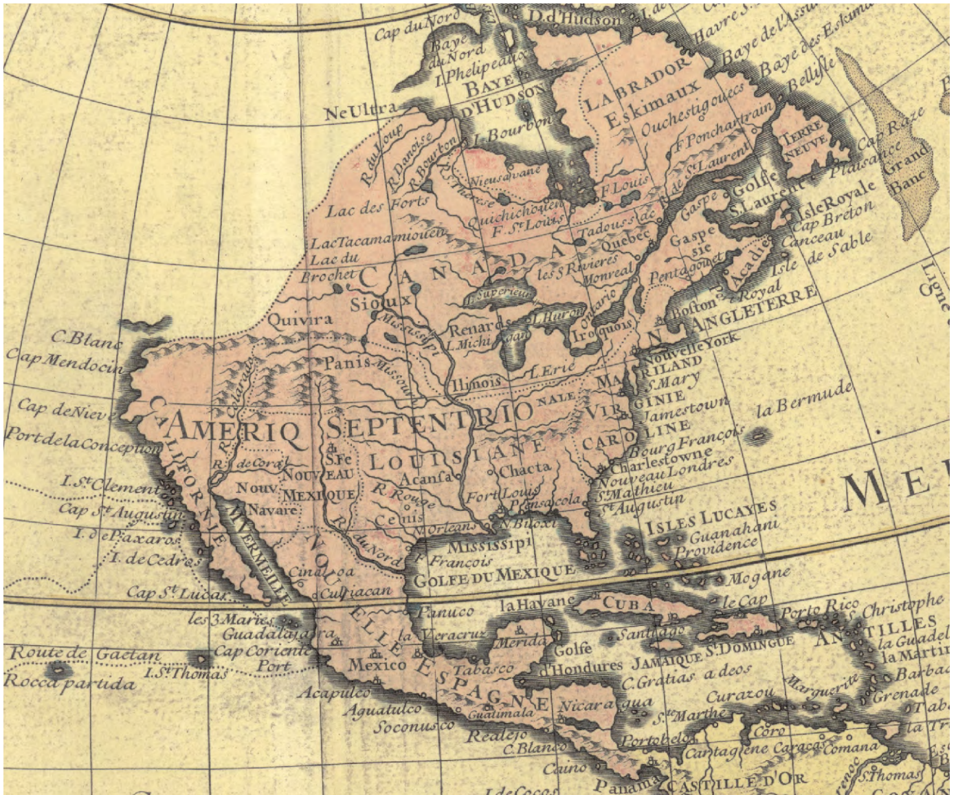
Quote from Moriai-ke "Nikki kakitome chō" (p. 50-52). Map by Guillaume Del'Isle