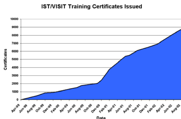
Figure 2. Cumulative number of IST/VISIT training certificates issued from April 1999 through August 2002.

From April 1999 through September 2002, the training provided by the IST PDS and VISIT program has resulted in the following: