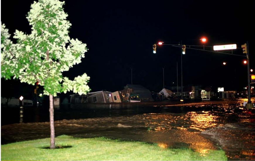
During the flooding in Fort Collins (CO), a 16-foot high pile of mobile home debris jammed against the College Avenue Bridge near midnight on July 28, 1997.

general runoff, plus water from the Canal Importation Basin, sent a total of 8,250+ cfs (cubic feet per second) of water directly into a 50 acre detention pond. The eastern side was bordered by a 19' high railroad embankment with several culverts that allowed excess water to move eastward. This facility had been designed to collect and hold nearly double the predicted 500-year flood overflow.