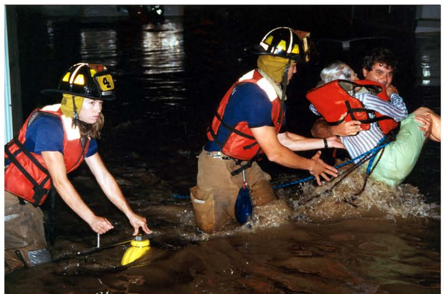
PFA firefighters carry a victim rescued from the Johnson Mobile Home Park to safety as a third firefighter turns on water pressure in submerged hydrant. Below the water is a 5" fire line that will be used to douse the trailers burning in the background.

Heavy rains are rare in the High Plains. The city of Fort Collins' annual average yearly rainfall is 15 inches, most of which occurs in the late fall or early spring. When heavier rains do come,