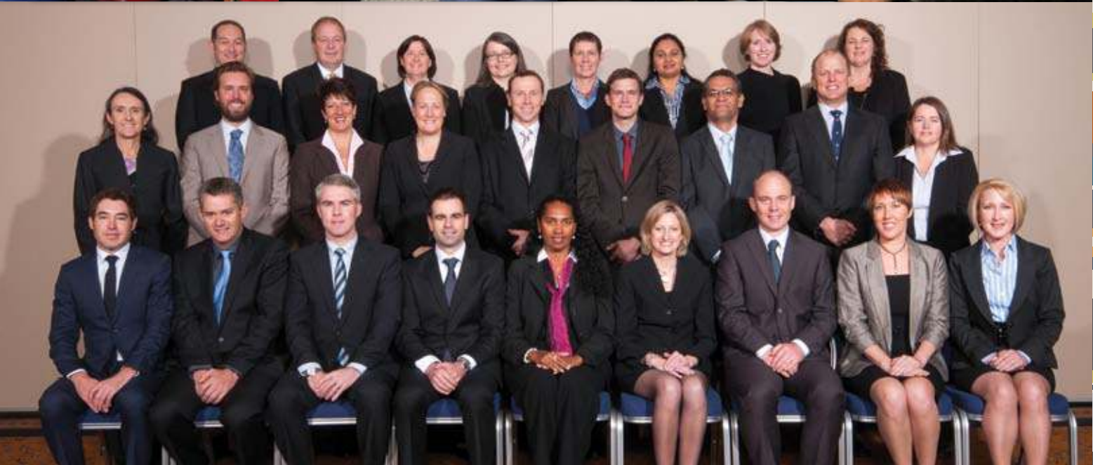
THESE COURSE PARTICIPANTS ARE COMMITTED TO SHAPING THE FUTURE OF RURAL, REMOTE AND REGIONAL AUSTRALIA.