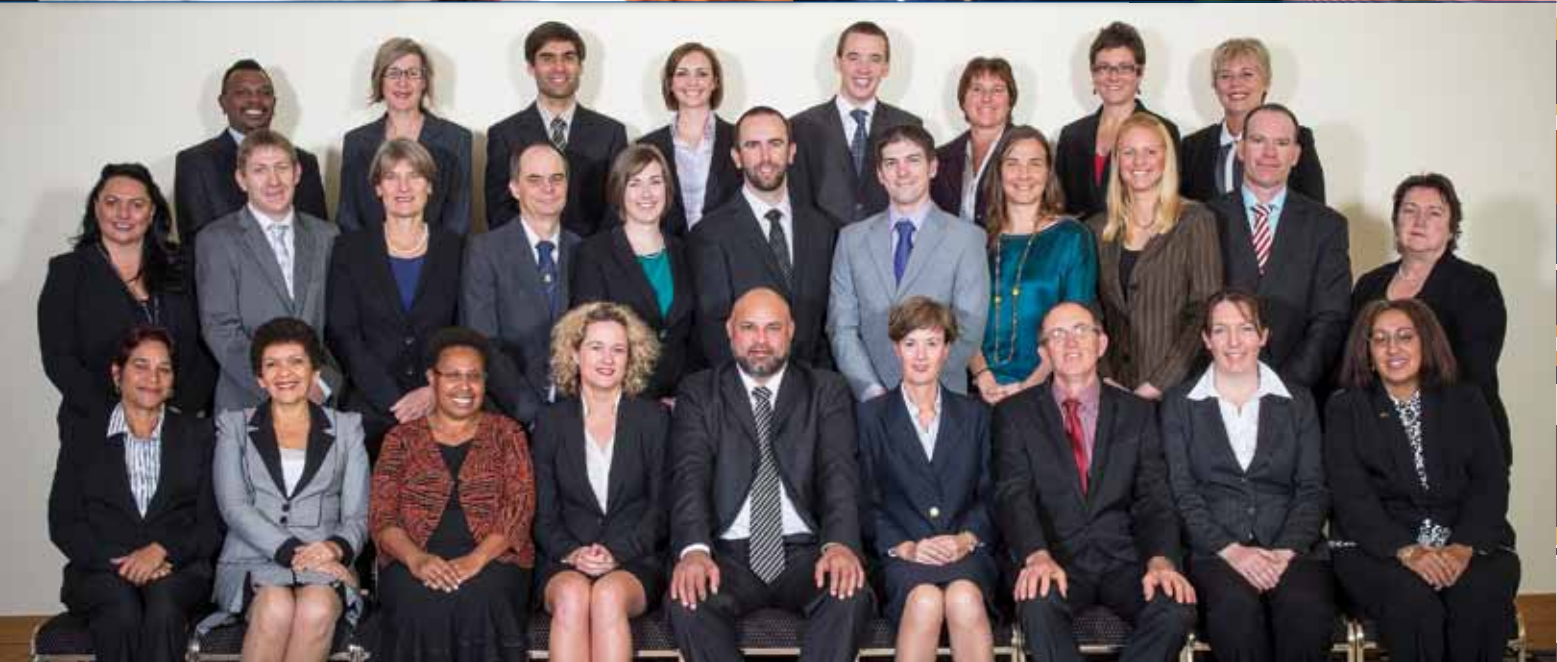
THESE LEADERS ARE COMMITTED TO SHAPING THE FUTURE OF RURAL, REMOTE AND REGIONAL AUSTRALIA.