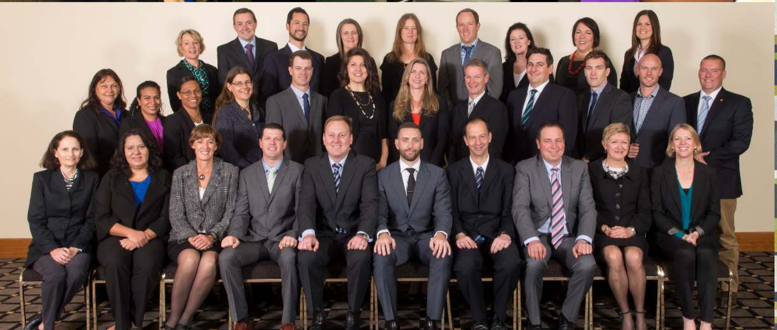
THESE LEADERS ARE COMMITTED TO SHAPING THE FUTURE OF RURAL, REMOTE AND REGIONAL AUSTRALIA.