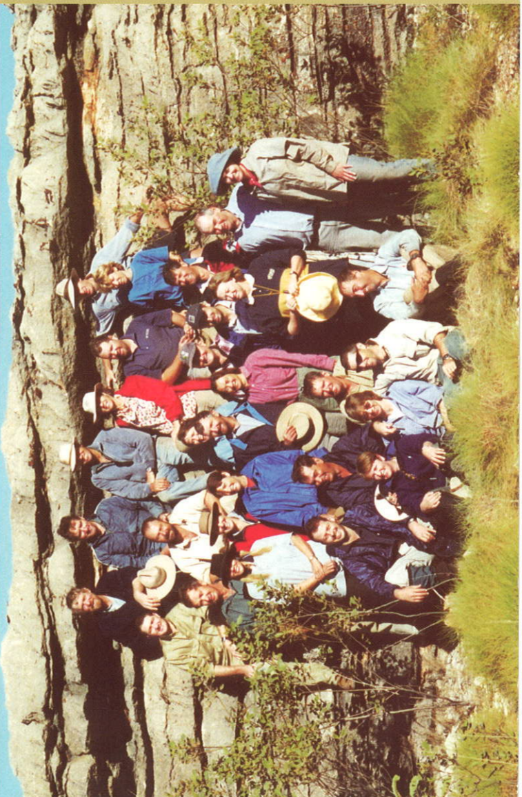
Course 7 is kindly sponsored by

AUSTRALIAN RURAL LEADERSHIP PROGRAM LEADING THE NATION