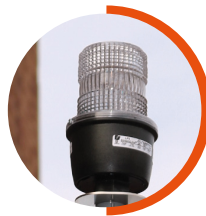
AUTOMATED STROBE LIGHTS