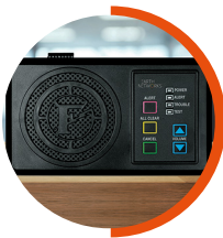
INFORMER CONTROL BOX