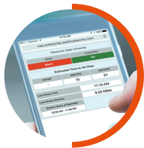
ALL-CLEAR COUNTDOWN CLOCK