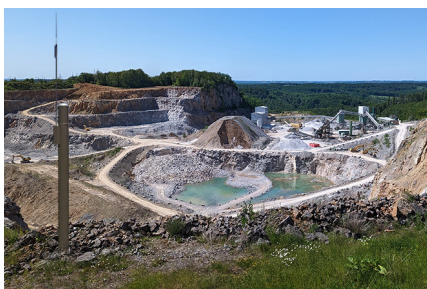
PRECISION HYDROLOGY AND WEATHER MONITORING SENSORS