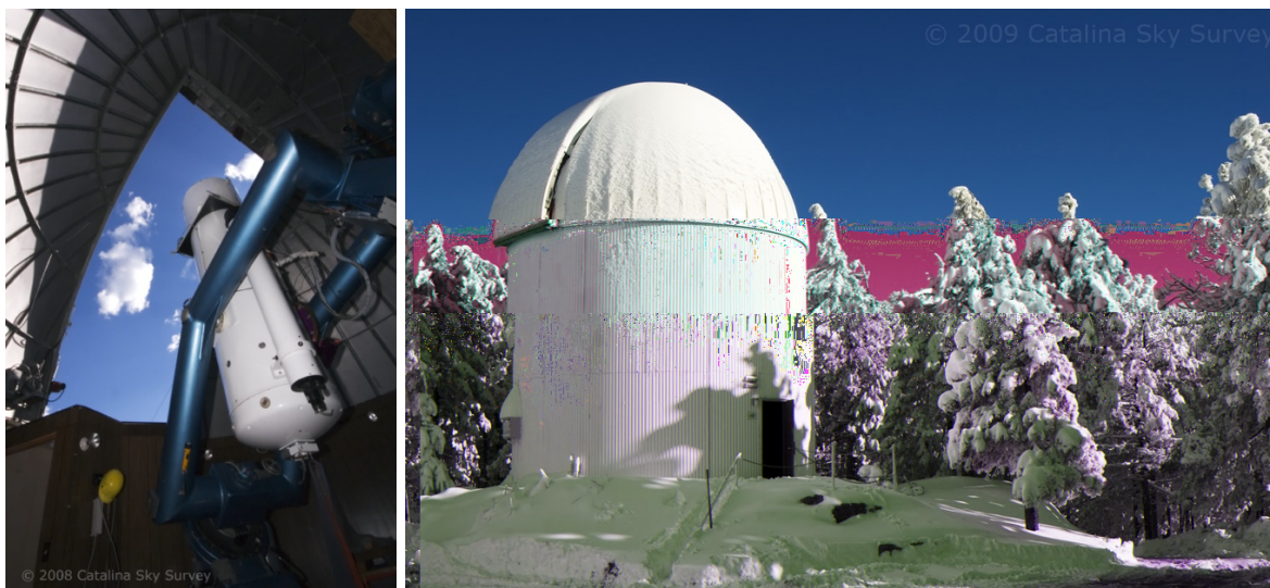
Figure 1 – The Catalina Sky Survey Schmidt telescope on Mount Bigelow, MPC code 703. This is the configuration of the telescope with its 4K x 4K CCD camera between 2003-2016. Catalina Sky Survey, L: 2008, R: 2009

The original Catalina Sky Survey used an earlier configuration of the Mount Bigelow Schmidt telescope. These photographic data are not (currently) considered for archiving in the PDS Small Bodies Node. Modern CSS operations began with the Schmidt in its current configuration of a 0.7-m primary and full-aperture corrector. This is a rather thick corrector and CSS has been funded to evaluate an upgrade to the optics of this telescope. If so, this would likely result in a new telescope and instrument context for PDS.