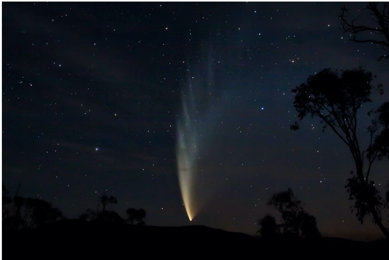
Figure 3 – Comet C/2006 P1 McNaught; photo taken from Swifts Creek, Victoria, Australia at approx. 10:10PM. Taken at f/4, ISO 800, 20 seconds and ~24 mm with post-processing in Photoshop to bring out details.

From 2003 to 2013 Catalina Sky Survey operated the only major NEO survey telescope in the southern hemisphere in partnership with the Australian National University using the 0.5-m Uppsala Schmidt telescope at Siding Spring Observatory in New South Wales, Australia. The Siding Spring Survey operated under MPC code E12 and is credited with discovering 467 Near-Earth Asteroids as well as many comets, including Comet McNaught, the “Great Comet of 2007” (see figure 1).