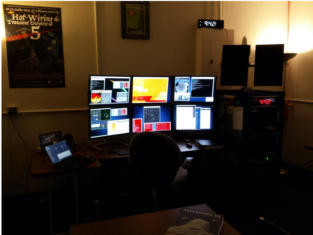
Figure 4 – CSS remote observing console at the Lunar and Planetary Laboratory on the campus of the University of Arizona in Tucson. This is a frequent station for the observer for Catalina’s 1-m follow-up telescope, I52. G. Leonard

Catalina Sky Survey realized a significant addition to its NEO discovery capabilities with the commissioning of the 1.0-m astrometric follow-up telescope on Mount Lemmon, MPC code I52. By offloading same-night and subsequent follow-up responsibilities from the survey telescopes, these are freed to generate even more candidate NEOs for follow-up. The combination of I52 and later V06 (below) have become the most productive follow-up telescopes for NEOCP follow-up and arc extensions. A major prime focus upgrade to I52 is nearing completion. I52 was also the first CSS telescope to be operated fully remotely from the University of Arizona campus as well as from the control room of our other telescopes and has served as the pilot for such capabilities to remotely operate our other telescopes, including from our observers’ homes during the COVID pandemic.