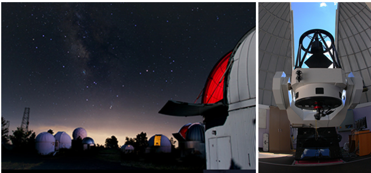
Figure 7 – Mount Lemmon SkyCenter and the 0.8-m Schulman telescope.

CSS is always looking for access to new, or new-to-us, telescopes. In the near future this will include the 0.8-m Schulman telescope of the Mount Lemmon SkyCenter 4 , which is MPC code G84 when used for astrometric follow-up. We have been funded by NASA to provide a new camera and will receive a significant amount of telescope time in return. The Schulman will be used for astrometric follow-up to offload brighter objects from Catalina Sky Survey's nearby 1.0-m I52.