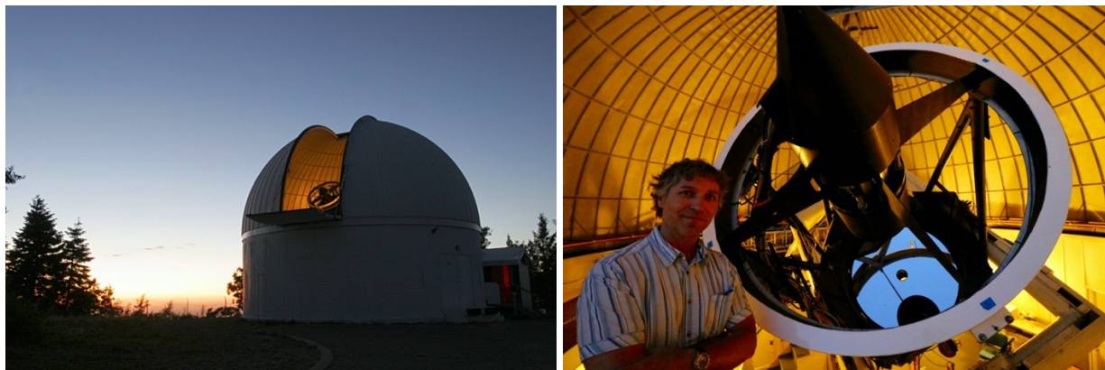
Figure 2 – The 1.5-m Catalina Sky Survey telescope on Mount Lemmon, MPC code G96.

The Catalina Sky Survey 60-inch survey telescope on Mount Lemmon, MPC code G96, has been a significant contributor to the annual Near-Earth Object discovery statistics since 2005. Indeed, as of 2020, G96 is the most prolific single telescope in the grand total of NEOs discovered (7,814) and NEO observations (178,966), as well as of incidental observations of asteroids of all kinds (45,715,932).