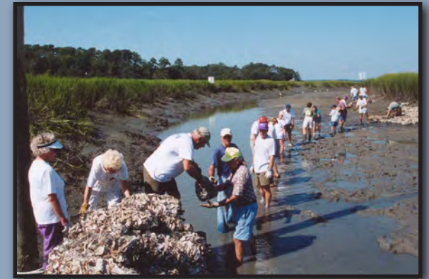
Volunteers form a human chain to pass the shell bags to the shoreline