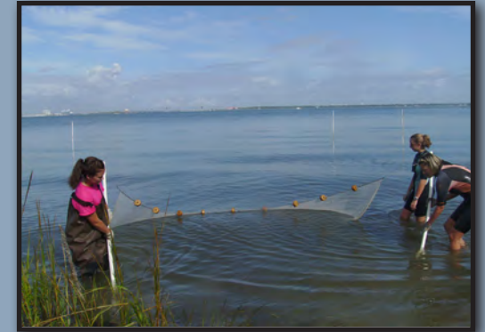
Volunteers sample around oyster reefs