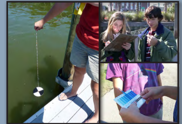
Volunteers monitor water quality weekly at restoration sites and enter data online at our interactive website http://score.dnr.sc.gov