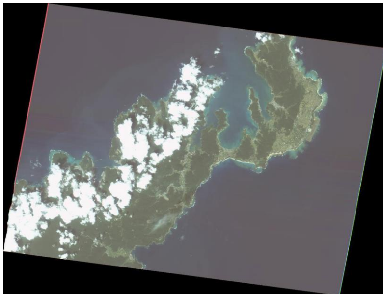
Satellite image by NARL

https://sentinel-asia.org/EO/article20200904JP.html