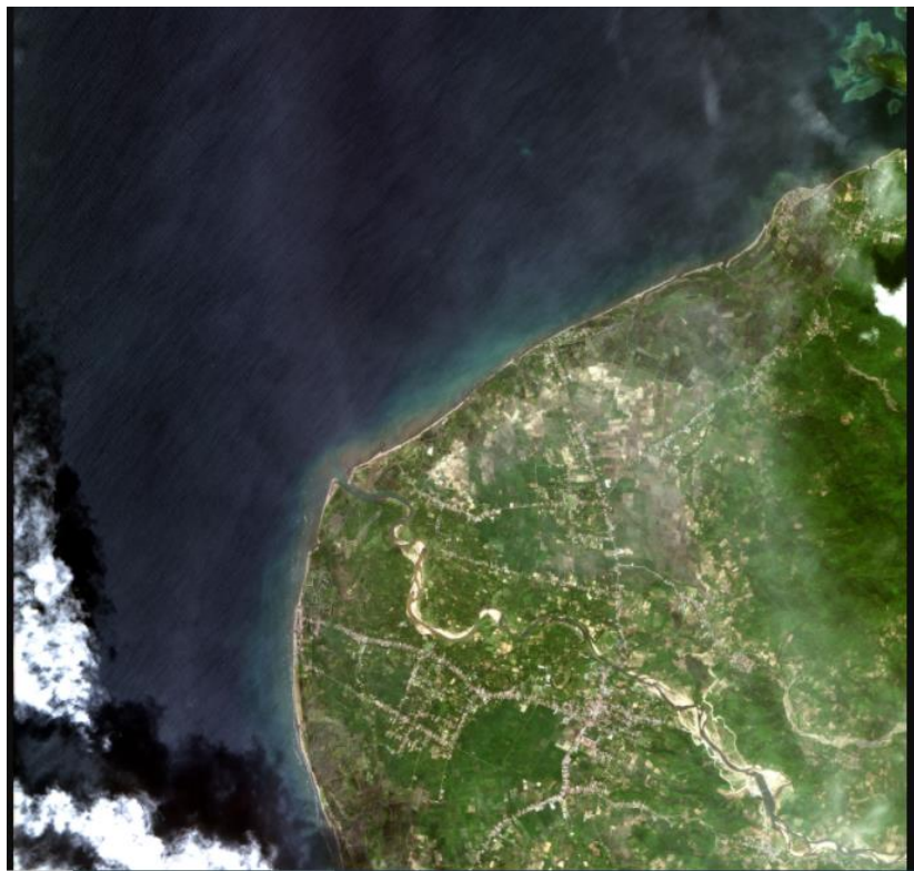
Satellite image (KhalifaSat)