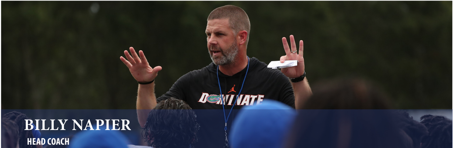
BILLY NAPIER HEAD COACH

Billy Napier enters his first season with the Gators after being named the 29th head coach in program history on Nov. 28, 2021