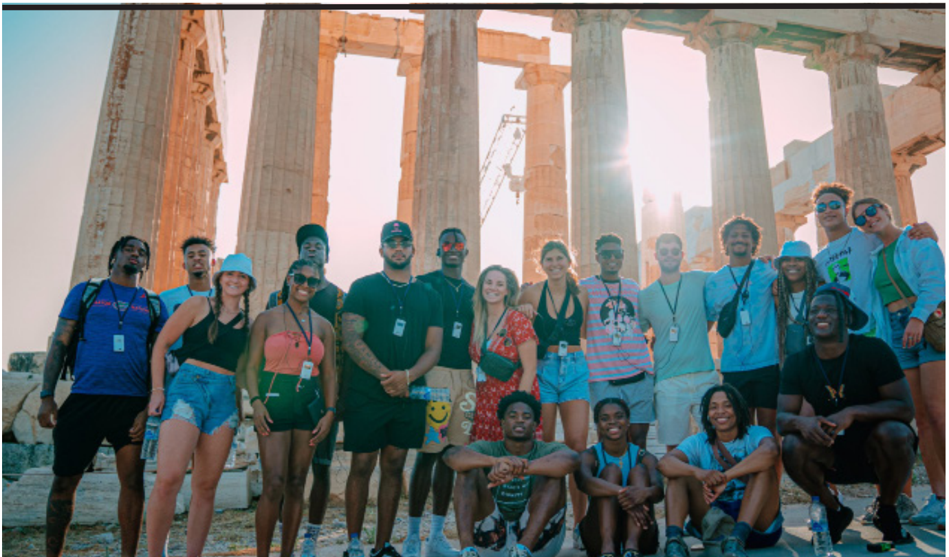
SIXTEEN GATORS SCHOLAR-ATHLETES traveled to Greece this summer for a 10-day service trip.

"This is an area where people can invest in the player. And at the University of Florida, with the alumni network that we have and the top-five university education that we offer, there's no reason we can't do just that." - Head Coach Billy Napier