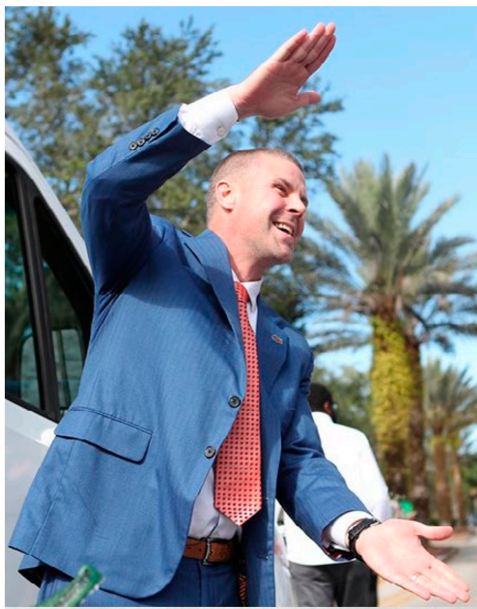
BILLY NAPIER compiled a 40-12 record in four years as head coach at the University of Louisiana Lafayette.

Napier's deep roots in the game include stints on both Clemson coach Dabo