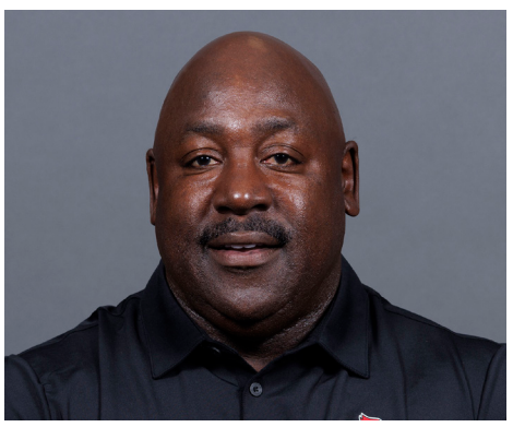
Wesley McGriff Secondary | Field