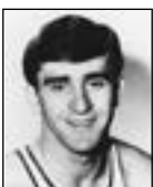
42 - Pat Riley 1965-67