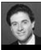
Rick Pitino Head Coach – 1990-97