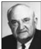
Adolph Rupp Head Coach — 1931-72