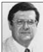
Joe B. Hall Head Coach – 1973-85