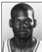
24 - Jamal Mashburn 1991-93