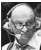
Cawood Ledford "Voice of the Wildcats" 1953-92