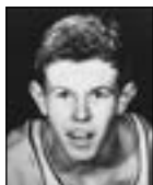
*30 - Frank Ramsey 1951-52, 54