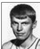
44 - Dan Issel 1968-70