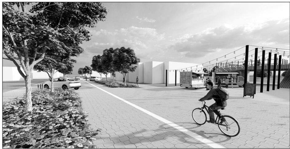
A street level view of Main Street.