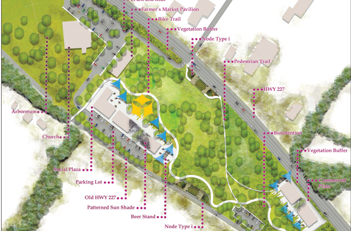
This is an overview of the team's design.

As earlier reported this project did not start because of CEDIK. This project started