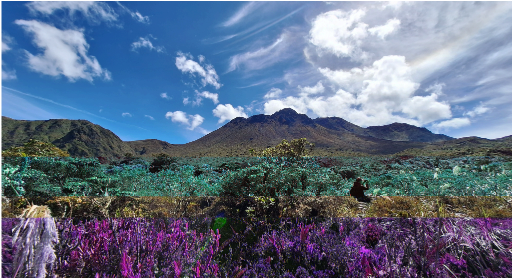
Doña Juana Volcanic Complex. (Parque Nacional Natural Doña Juana-Cascabel, Nariño)

Knowledge gaps persist at long dormant but potentially active volcanoes in the Northern Andes. Eruptions remain highly hazardous due to population growth, especially in areas with fragmented social memory. In this workshop, we will share experiences in approaching tropical, calc-alkaline polygenetic volcanoes hosting the pristine páramo and Andean Mountain Forest ecosystems. Specifically, we will share the newly released map of Galeras Volcanic Complex, as an example of a peri-urban and rural (indigenous) setting (Pasto). In comparison, we will explore the mapped Doña Juana Volcanic Complex, in the heart of the Macizo Colombiano , to discuss multidisciplinary field techniques useful to approach remote, poorly known terrains, where the completeness of the geologic record is compromised by fast rates of vegetation growth, weathering and erosion in the tropical climate and active tectonics across the North Andean block. At Doña Juana, we will also share experience and discuss strategies to integrate geosciences, ecology, archaeology, arts, design, and social sciences to involve local communities in co-building knowledge.