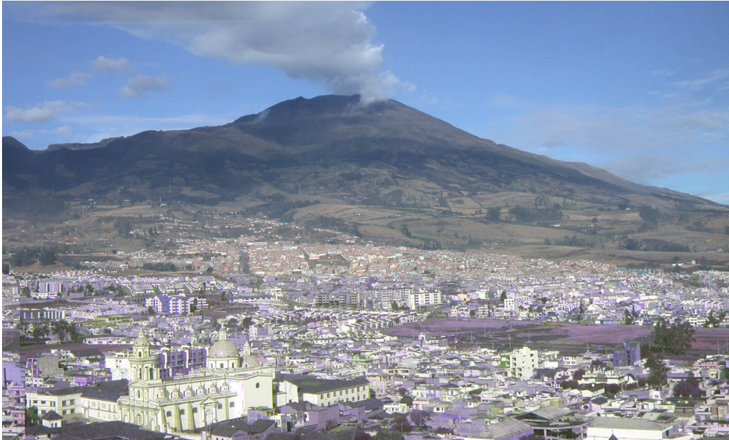
The town of Pasto and the smoking Galeras Volcano