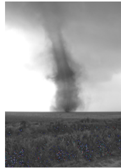
Carteret County tornado 2004

Last year was a record setting year for tornadoes in North Carolina. Seventy tornado touchdowns were reported from the mountains to the coast. Over the past 10 years, nearly 400 tornadoes have struck North Carolina resulting in 6 deaths, 291 reported injuries and about $231 million in damage. Fortunately, most tornadoes that strike the state are relatively weak and short-lived. However, even weak tornadoes pack winds of 60-110 mph. April is the peak month for tornadoes in eastern North Carolina.