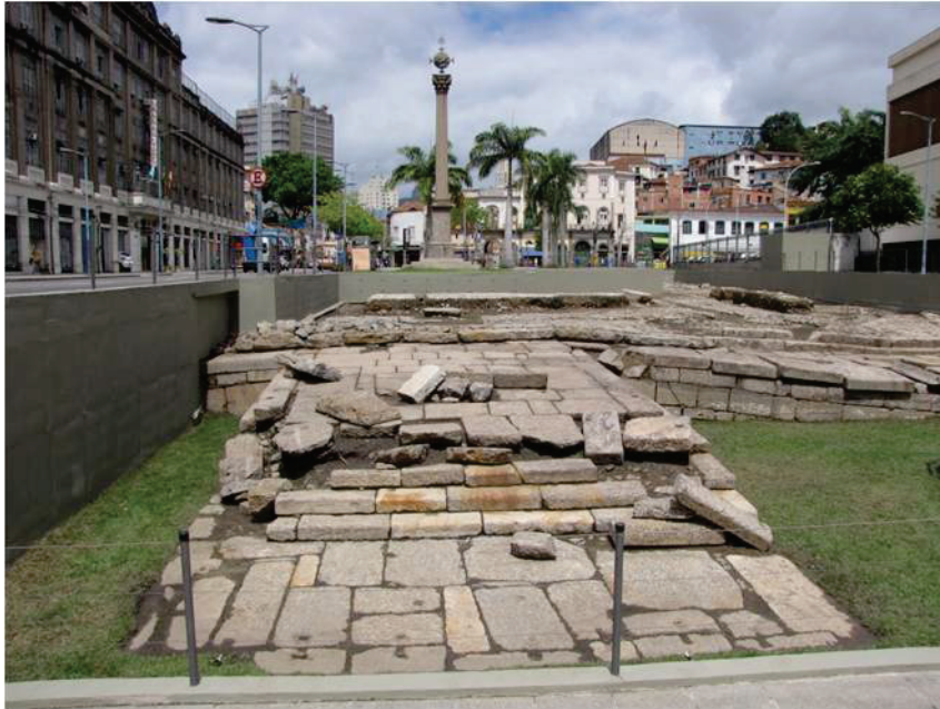
View of Valongo Wharf