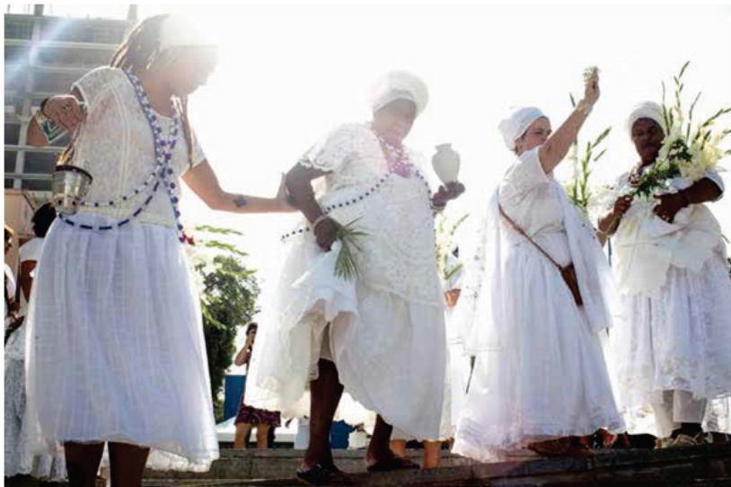
Symbolic washing of the Wharf