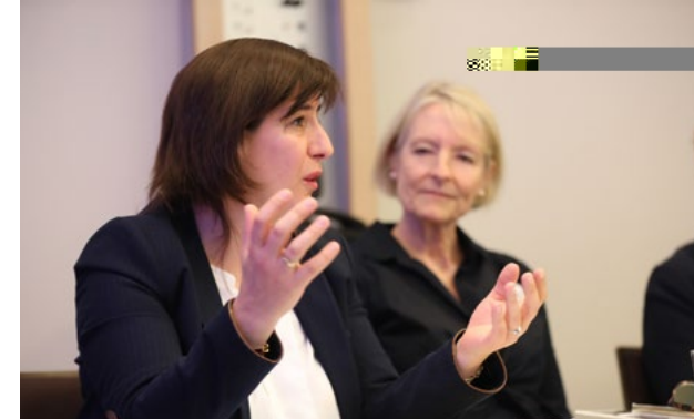
Participants of the 2018 expert workshop, Monte Carlo