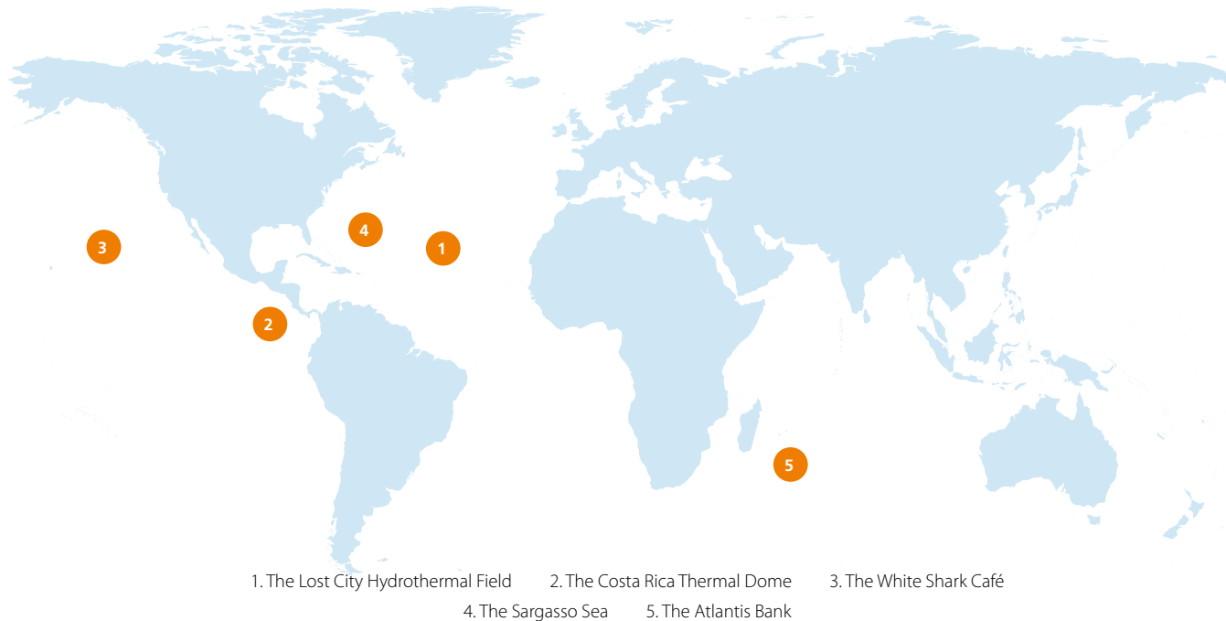
Figure 3: Illustrations of potential Outstanding Universal Value in areas beyond national jurisdiction