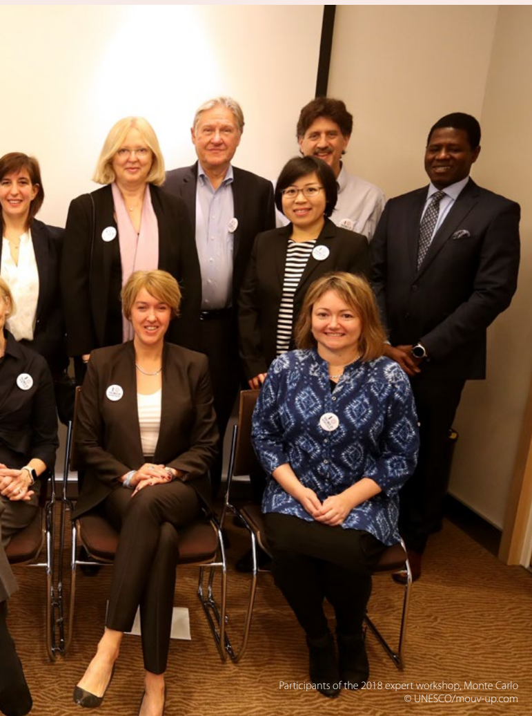
Participants of the 2018 expert workshop, Monte Carlo