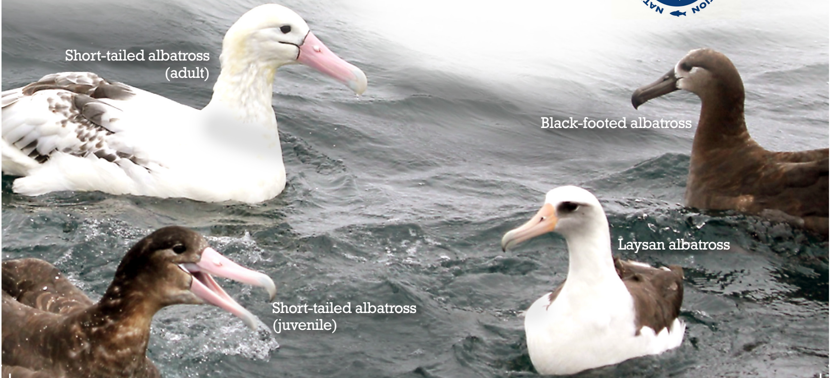
Short-tailed albatross (adult)