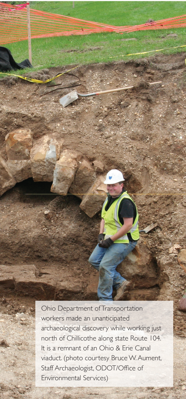
Ohio Department of Transportation workers made an unanticipated archaeological discovery while working just north of Chillicothe along state Route 104. It is a remnant of an Ohio & Erie Canal viaduct.