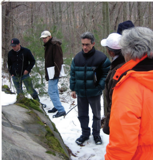
Section 106 consultation with an Indian tribe