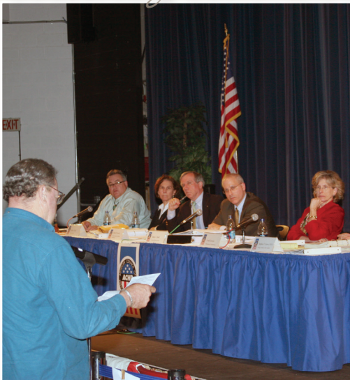
A panel of ACHP members listen to comments during a public meeting.