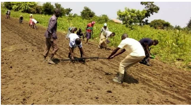
Farmers learning to make planting lines using a Planting fork (Lira-Upland MFS demo site)