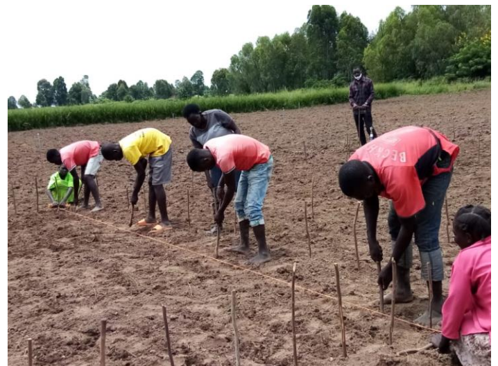
Planting in field experiment in Abi ZARDI

which are to find out suitable varieties that would grow well in the area. Other experiments in ZARDIs like in Bulindi expected to start in September.