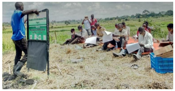
Farmers learning how to plan and record their seasonal activities (Bugweri - Lowland MFS demo site)