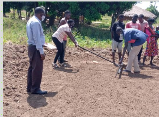
Farmers practicing sowing with a planting fork

trainers of the day. He also urged AOs to effectively utilize the MFS trained farmers to increase rice production in Uganda.