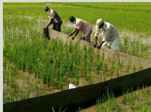
Corrugated plastic iron sheets being set up in Doho NPT field

In Butaleja, Doho Irrigation scheme, weeding was done and corrugated plastic sheets were set up in the experiment field. This will assist in controlling rat damage, give desired irrigation to the experiment plots and also indirectly help in making an effect of fertiliser. Through periodic communication with the ZARDI staff, the Project is able to monitor the field condition in the other sites.