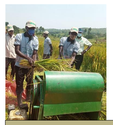
Farmers in Kitagwenda threshing rice with a motorized thresher

cultivation techniques such as several weeding works and securing unmixed seed for a better yield in the next season. In Budaka, PRiDe II staff conducted a yield survey and the expected harvest is about 4t/ha. During the MFS graduation ceremony at the end of December, farmers thanked JICA and PRiDe II for equipping them with the appropriate skills for rice cultivation. They agreed that utilization of the knowledge they learned during the MFS training will increase the productivity and improve quality of rice.