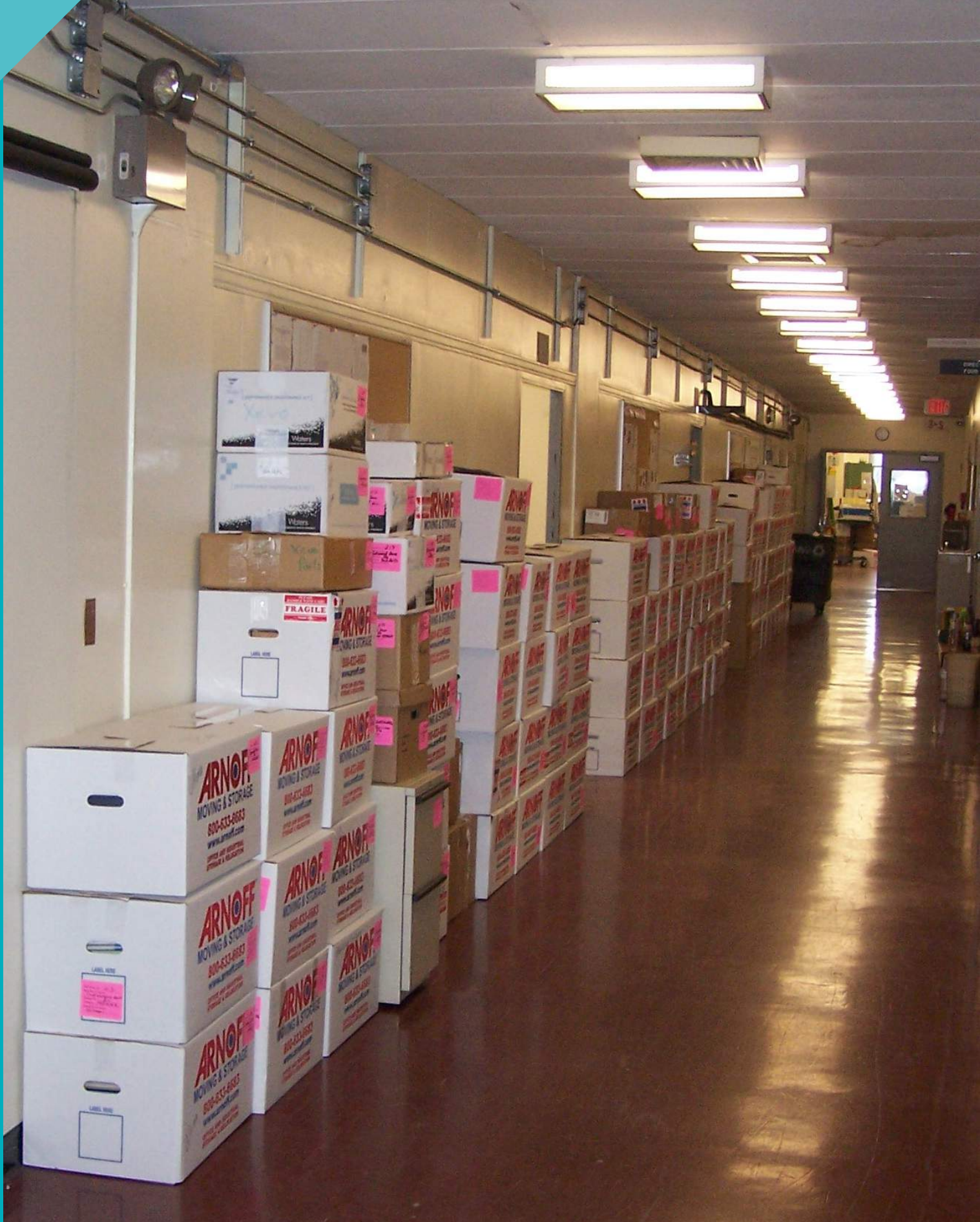
Planning the laboratory move a year in advance helped the New York State Department of Agriculture and Markets stay organized