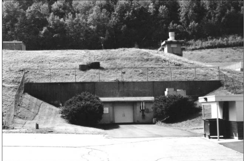
Fig. 1. Bunker—main entrance