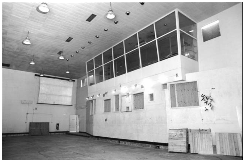
Fig. 3. Bunker—war room