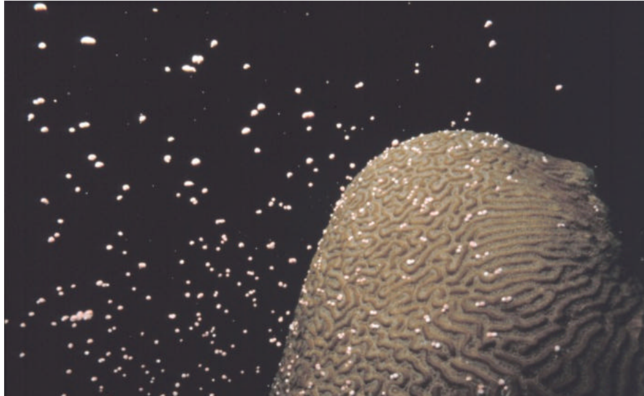
Brain Coral spawning in Flower Garden Banks National Marine Sanctuary