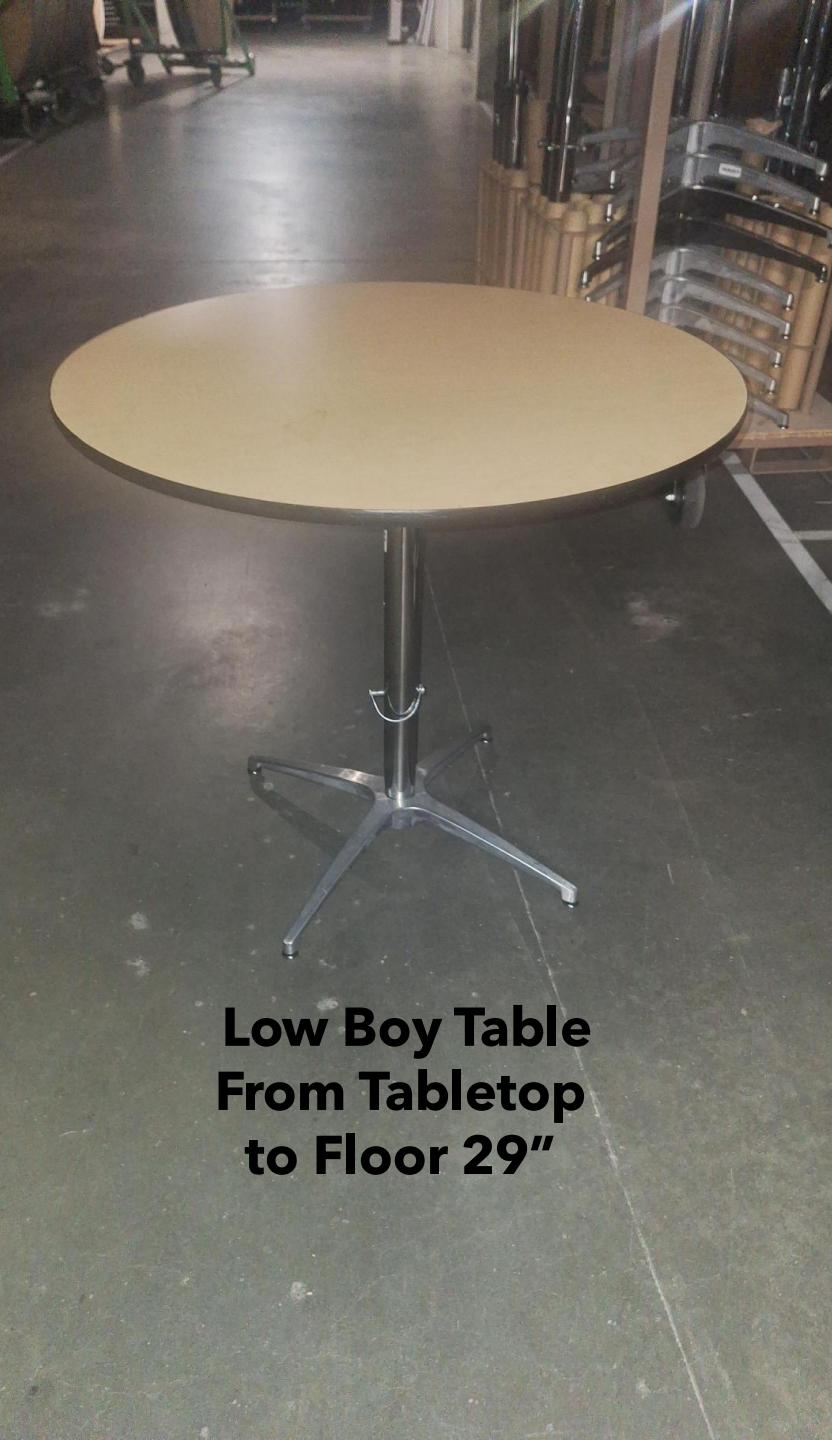
Low Boy Table From Tabletop to Floor 29"