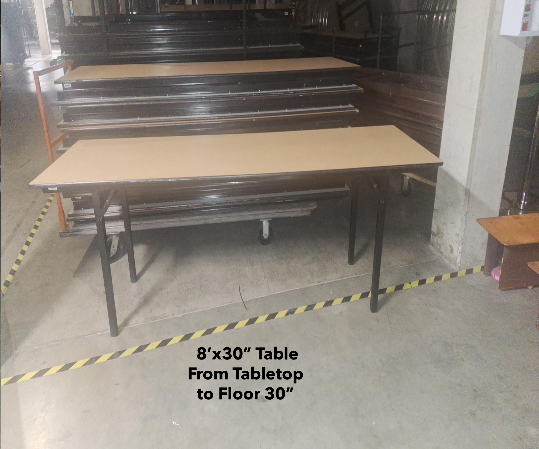
8'x30" Table From Tabletop to Floor 30"