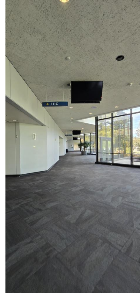
Elevators for Access to 200 level