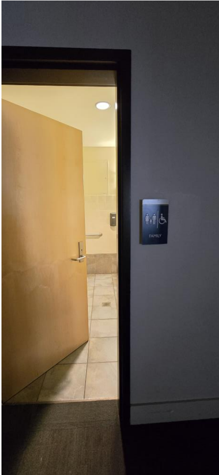
Large Family/Neutral ADA Restroom