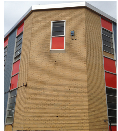
Wireless transmitters communicate to a Smart Wireless gateway 300 feet and more through reinforced concrete and glass.

Although the odor control tower is 200 yards past the solids room, over 1000 yards from the gateway, the new instruments joined seamlessly. On-line monitoring gives early warning of bearing wear, giving readings once per hour instead of once every 3-6 months. It also eliminates the time required to plan and take manual readings. “PeakVue is great” said Helfer. “We have a lubrication and oil program that requires us to constantly check to see if bearings are lubed properly. We now use PeakVue to indicate when to lubricate the bearings on our centrifuges and fan motors.”