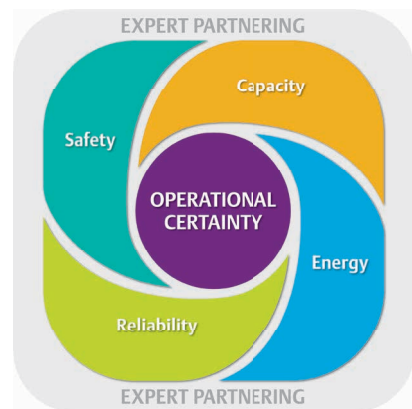
Figure 1: Four areas where digital transformation can improve terminal operations.