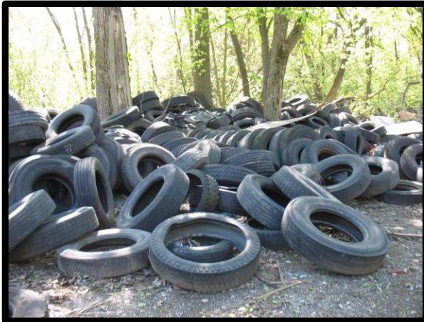
Figure 1: Abandoned scrap tire pile

Abandoned tires (often found in abandoned scrap tire piles) have been discarded and do not remain within the control of the generator, and thus do not meet the criteria set forth in 40 CFR section 241.3(b)(1). They are not being managed as a valuable commodity and are solid waste. Even though abandoned tires could be beneficially reused whole as fuel, the statutory definition of solid waste under the Resource Conservation and Recovery Act (RCRA) does not allow this. A discarded tire does not lose its status as a waste solely because it is burned for energy recovery (76 FR 15476).