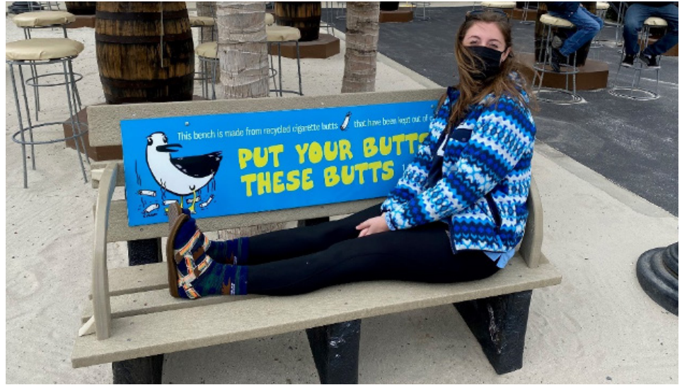
"Put Your Butts on These Butts" bench in Ocean City, MD.

More than 400,000 cigarette butts have been recycled through the Cigarette Litter Prevention "butt hut" program. Cigarette butts are shipped to TerraCycle to be repurposed into benches. In July 2020, four benches made from recycled cigarette butts were delivered and installed in Ocean City to help create public awareness around proper disposal. Benches feature the slogan "Put your butts on these butts" and have been installed on the boardwalk