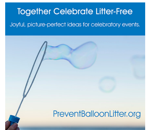
Blowing bubbles as an alternative to releasing balloons.

The “Prevent Balloon Litter” website offers inspirational litter-free ideas to commemorate important life events. Fun ideas include blowing bubbles, making paper airplanes or pinwheels, handing out native seeds to plant, creating a large banner, dedicating a bird bath or bench, and more. The website also offers resources such as educational activities, video content, and research publications on the issue. A short animated video , recently released by the Virginia Coastal Zone Management Program and Clean Virginia Waterways of Longwood University, is included on the website. To explore more of the campaign and sign the