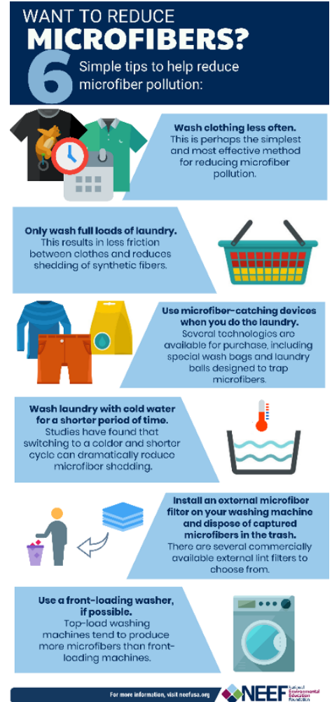
Infographic with tips on reducing microfiber pollution from the TFW article "What You Should Know About Microfiber Pollution."

Check out the Trash Free Waters Webinar Library for access to any webinars you may have missed over the past few months. In November, we hosted a webinar on "Experiences and Lessons Learned from Trash Capture Projects;" three expert speakers shared their knowledge and insight on trash capture planning, siting, installation, and maintenance. On March 11 we hosted the fifth webinar in the TFW series, "Reuse Models as Part of the Solution to the Plastic Pollution Crisis." This webinar explores three very different types of reuse and refill models, explaining how they work and the stories behind them.