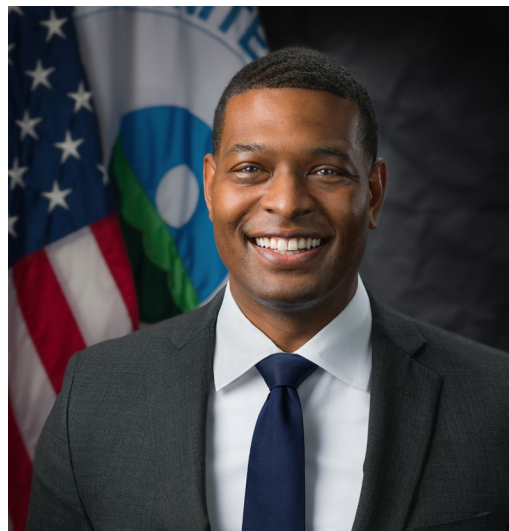
Administrator Michael S. Regan