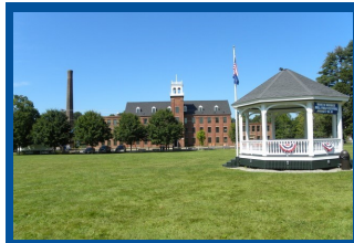
North Berwick Woolen Mill (after)

communities, and other stakeholders to work together to prevent, assess, safely clean up, and sustainably reuse brownfield sites. EPA provides financial and technical assistance for brownfields activities protect human health and the environment, encourage sustainable reuse, promote partnerships, strengthen local economies, and create jobs. By providing funds and technical assistance to assess, cleanup, and plan for site reuse, EPA enables communities to overcome the environmental, legal, and fiscal challenges associated with brownfield properties. EPA's investments in communities across the country help local leaders eliminate uncertainties, clean up contaminated properties, and transform brownfield sites into community assets.