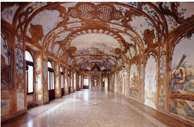
Palazzo Ducale, Mantova