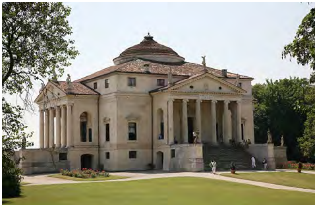
Villa La Rotonda