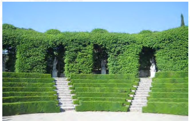
Gardens at Villa Rizzardi