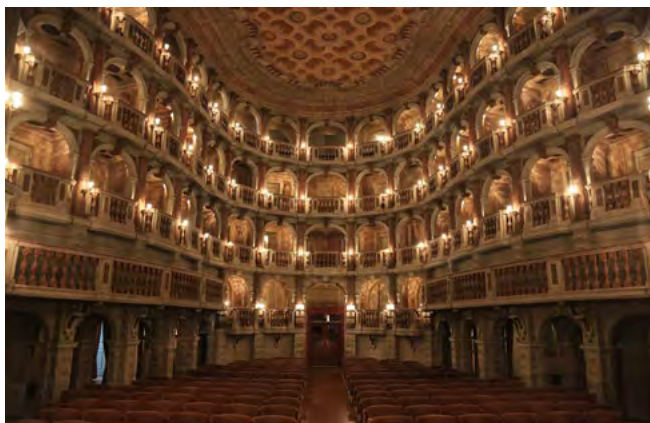
Teatro Scientifico del Bibiena