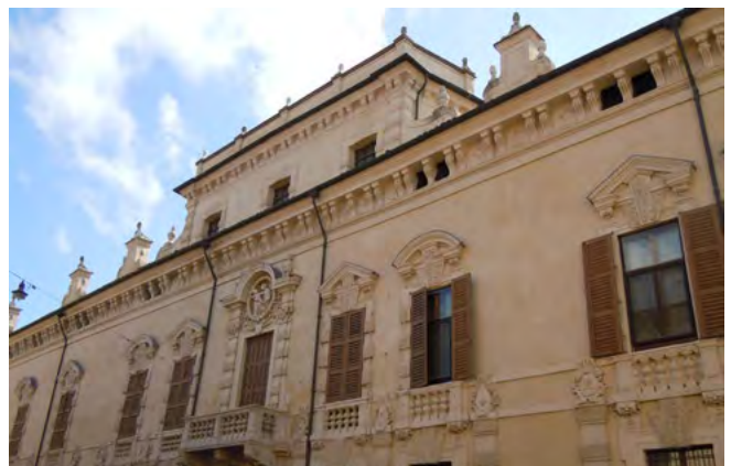
Palazzo Sordi, Mantova