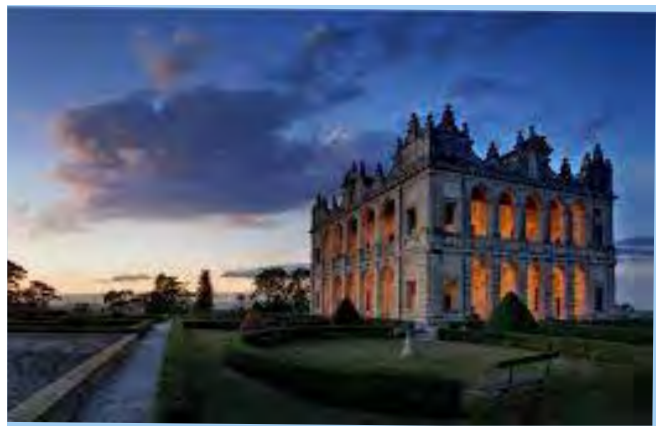
Villa Emo Capodilista