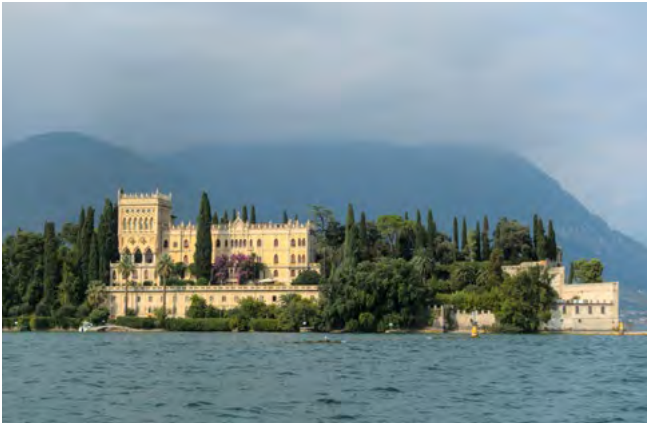
Isola del Garda