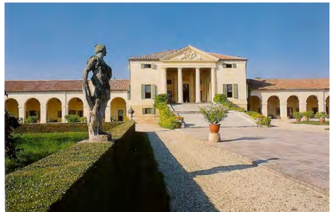
Villa Emo in Fanzolo