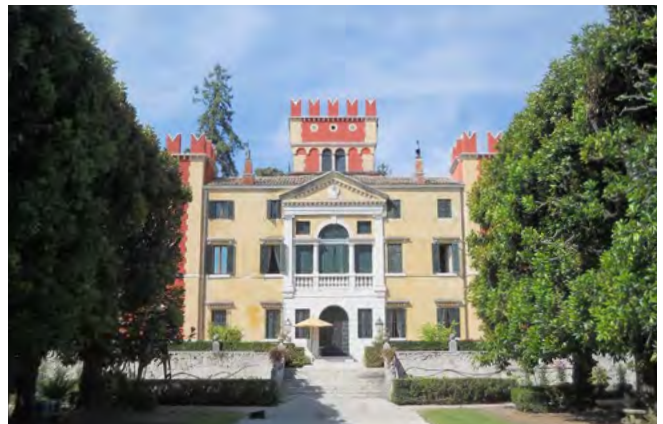
Villa Albertini in Garda