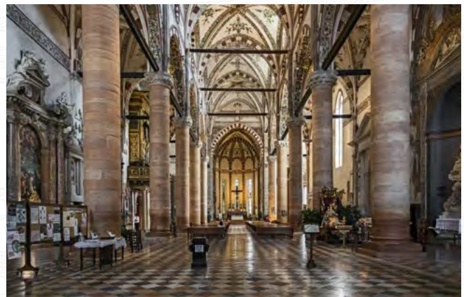
Chiesa Di Sant'Anastasia

Started over fifty years ago, the Collection Carlon in the Palazzo Maffei, is an eclectic collection grown without chronological limits dedicated to paintings, sculptures, engravings, drawings, miniatures, old books, but also pottery, bronzes, ivories, objects of daily life such as furniture and decorative objects, from antiquity to the present day.