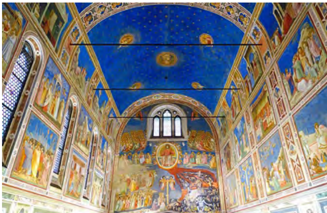
Cappella degli Scrovegni