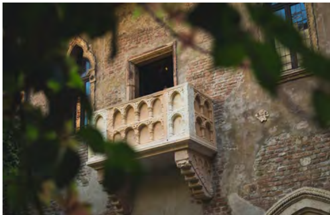
Romeo and Juliet balcony in Verona