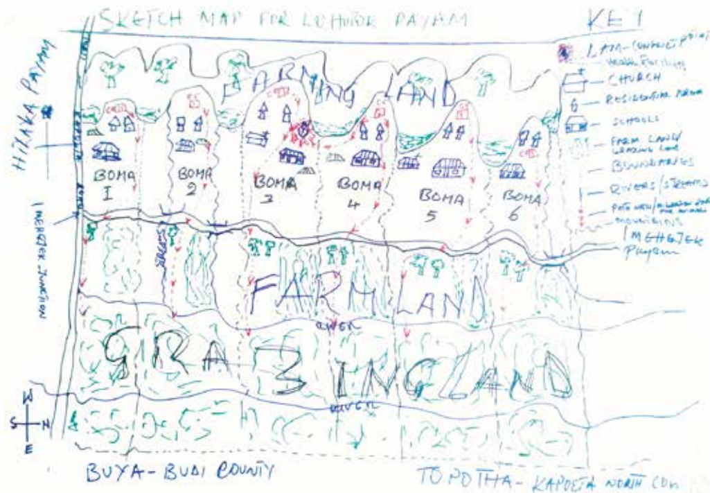
Figure 3 - Community mapping exercise in Kapoeta North, South Sudan