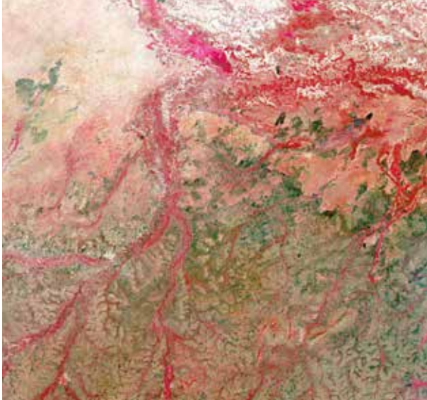
Figure 2 - South Sudan - Satellite-2A image, Nov. 2017